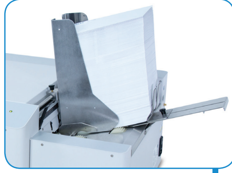
Integrated feeder holds up to 500 envelopes