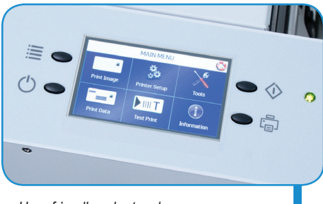
User-friendly color touchscreen

User-Friendly Touchscreen: 4.5" color touchscreen with adjustable backlight Fast: Prints up to 26,000 #10 envelopes per hour, up to 34,000 postcards per hour Two Independent Print Heads: 3-pen stitched + 3-pen stitched design Job Memory: Store and recall common print jobs, up to 16GB Integrated Feeder: Holds up to 500 envelopes USB 3.0 / LAN Connectivity: Easily connect to your print source Batch / Job / Lifetime Counters: Keep an accurate count of addressed pieces On-Screen Ink Monitor: Displays ink status (% used and approximate pieces remaining)