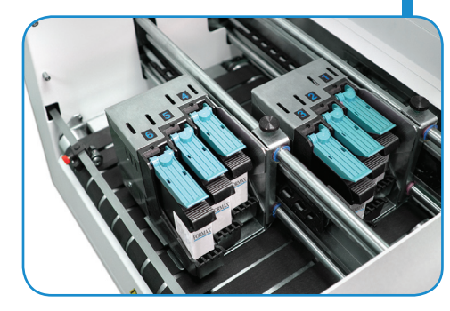
Two independent print heads: 3-pen stitched + 3-pen stitched design

Formax - New Hampshire, USA www.formax.com Local Dealer: